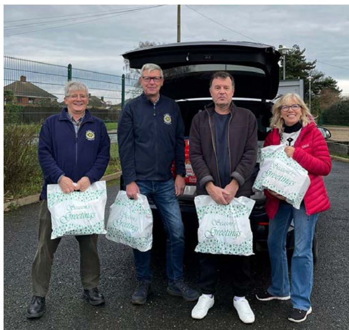
Some of the Rotarians doing a FIND Christmas parcels delivery