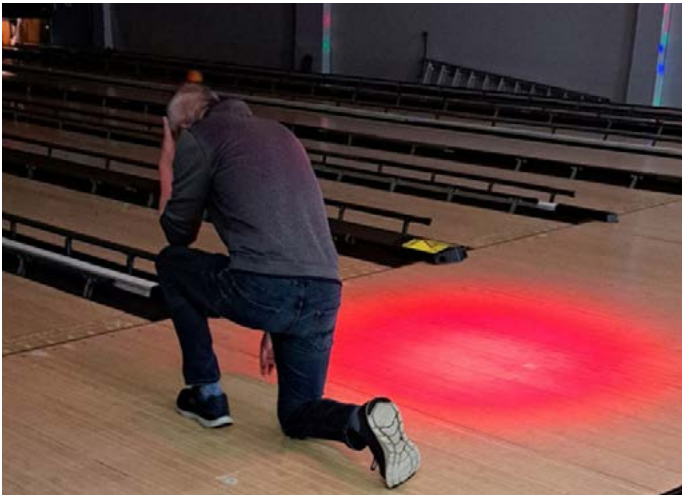
Despair for some!