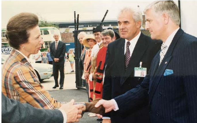
Official opening of Orwell Mencap Genesis in 1999, with HRH Princess Anne in attendance

on the management committee. An opportunity arose to become a Non Executive Director of the East Anglia Ambulance Service, which continued for some eight years, and I became a mentor to a number of senior officers.