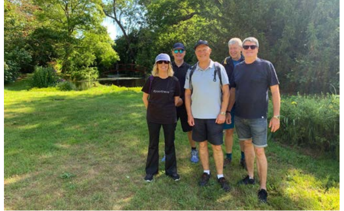
The walking gang at Decoy Farm during the walk