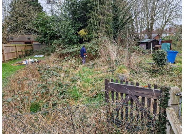
Before, with Jem already tackling the brambles

Also, bottom of the garden has been sown with wild flower seeds to create a natural wildlife habitat.