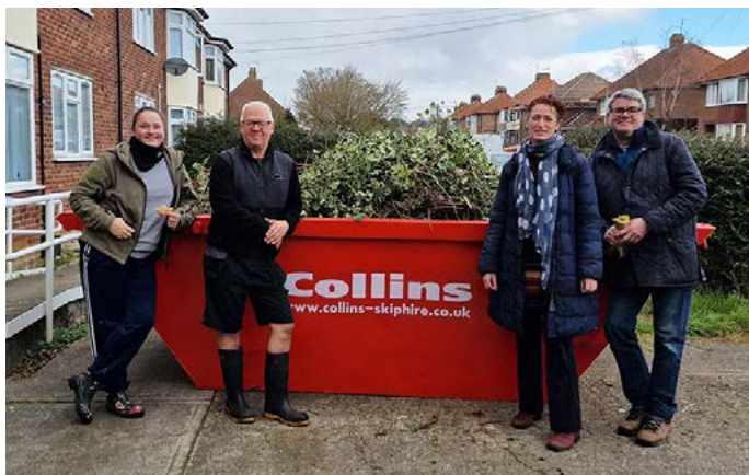
We had a visit (and donuts!) from a representative of Family First