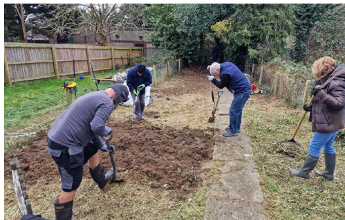
Removing big roots and stones before the rotavator work