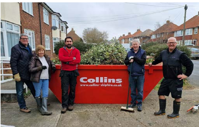
A big thank you to Collins skip hire for the donation of the skip