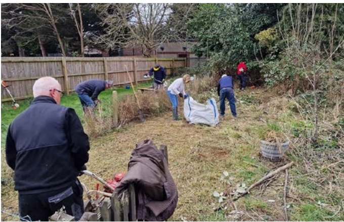
The gang hard at work

The photos show what a transformation was achieved... if any TV companies are interested, we are happy to do more in our 'Trash to Flash' garden makeover mini series!