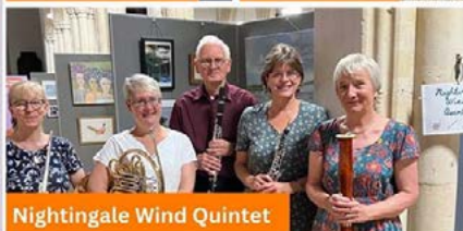
Nightingale Wind Quintet