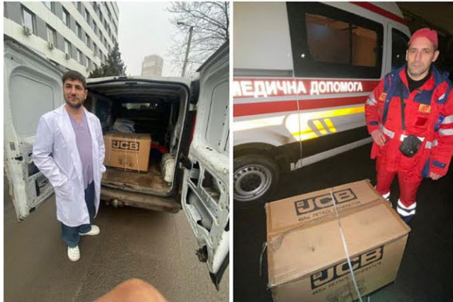
The club has donated three generators