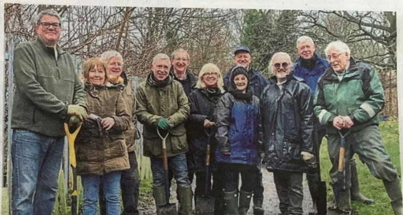
Getting stuck in

If you are a local charity and you'd like help from the willing hands at the Ipswich