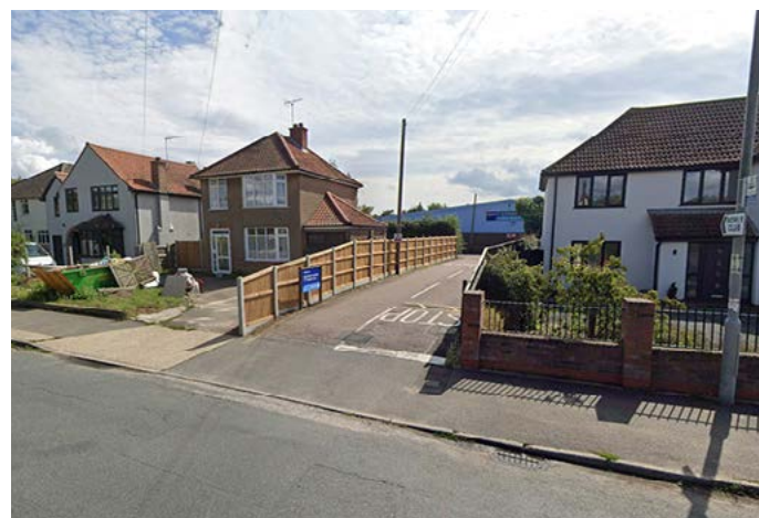
Entrance to the Bowling Club from Rushmere Road

If anyone has any queries on these arrangements please let me know as soon as possible, otherwise, I look forward to greeting you to this new venue on 2nd January 2024.