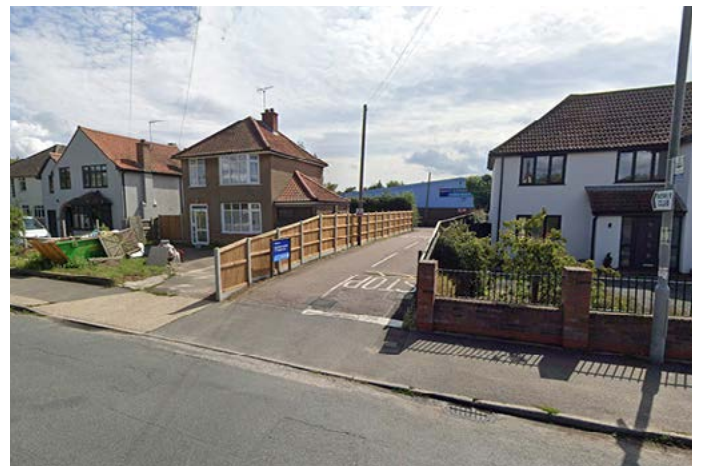
Entrance to the Bowling Club from Rushmere Road

If anyone has any queries on these arrangements please let me know as soon as possible, otherwise, I look forward to greeting you to this new venue on 2nd January 2024.