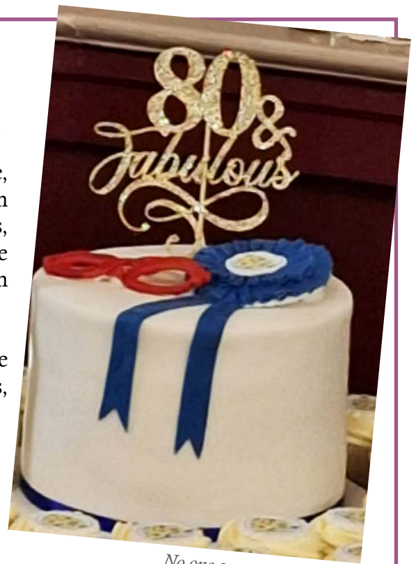
No one can argue with that!