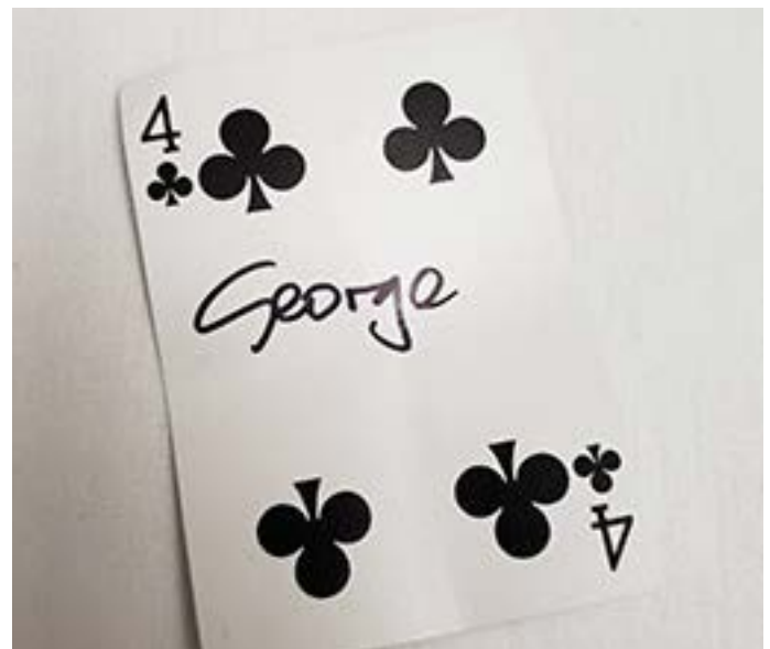
The card signed by one President George used for a magic trick, which left everyone baffled!