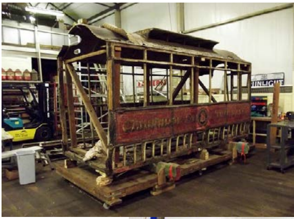
Before and after of a restoration project undertaken by the Ipswich Transport Museum