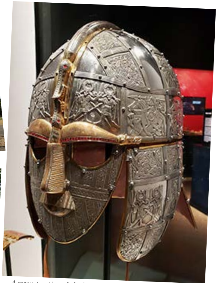
A reconstruction of the helmet found in the ship-burial, believed to have belonged to King Raedwald