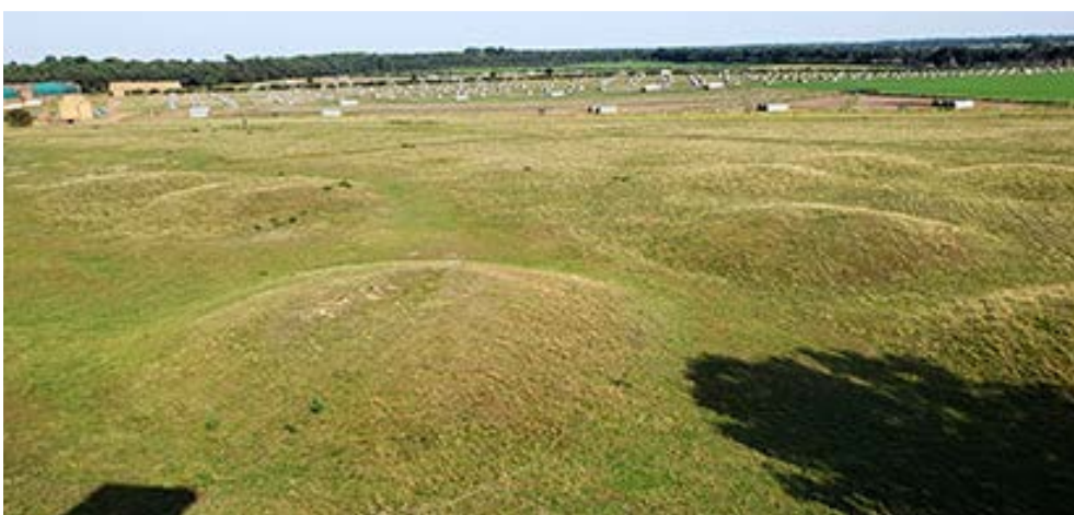
The view of the mounds from the observation tower at Sutton Hoo

Got any photos to share of our German friends during their visit? Did you go anywhere interesting? Did you take photos during the home dinners?