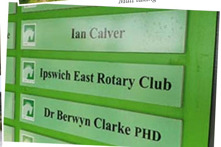
Supporters of the Suffolk Punch Trust