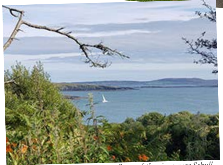
Some of the views near Schull