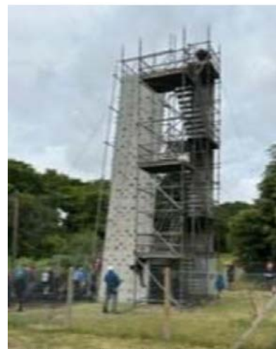
Climbing and Abseiling Tower

Lastly - Thank you to Rotary Kids Out for their support in the form of a £600 grant. We hope we did it justice.