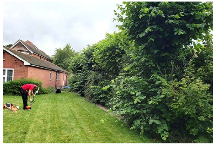
Before - side hedge

Well done to everyone involved, and special thanks to Billy for sorting out the logistics!