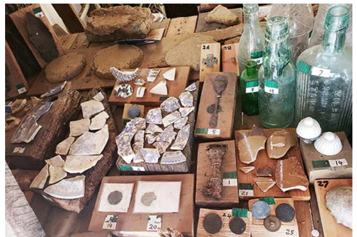
Some of the artifacts found so far during the renovations