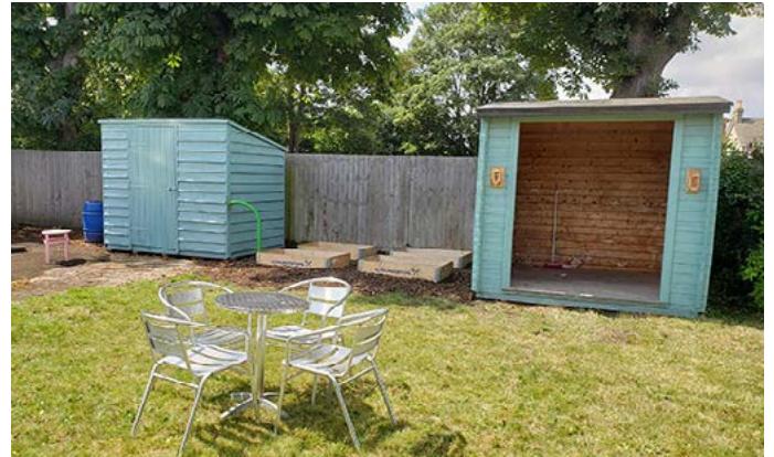
Final result of the sheds after painting