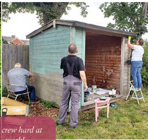
The crew hard at work!