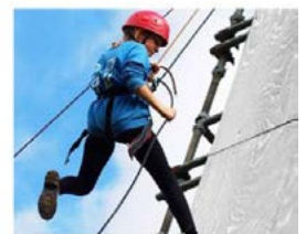
"Don't look down they said???"